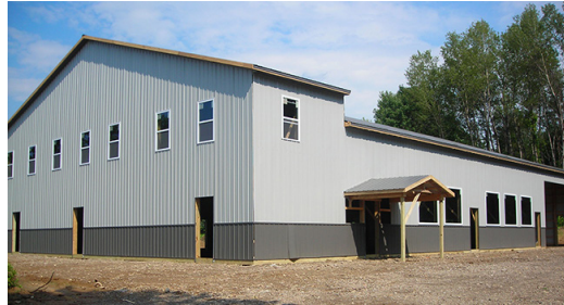
Finger Lakes Stairs & Cabinets