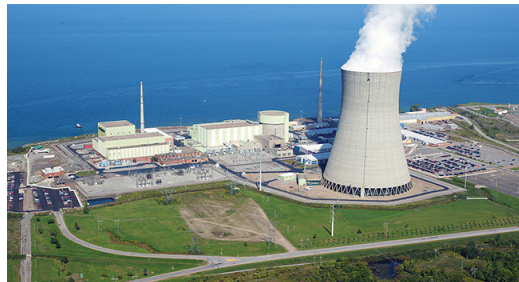
Nine Mile Point Nuclear Power Station