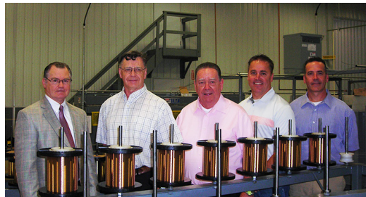
United Wire Technologies